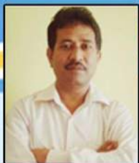
Malay Pit President